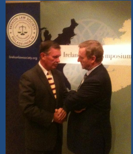
An Taoiseach with Brehon Law Society's Senator Rocks