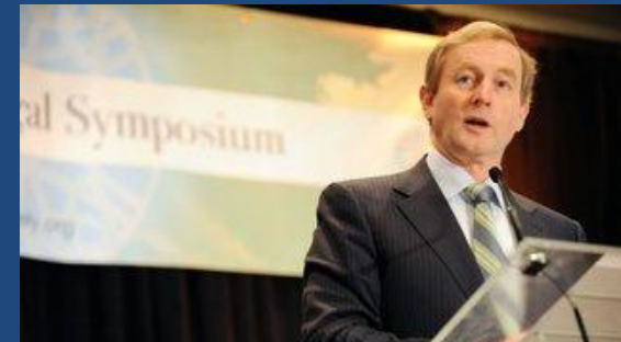
An Taoiseach addressing US-Ireland Symposium