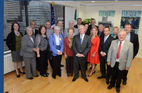
Tánaiste with representatives of the Irish immigration centers & New York GAA

Ard Chonsalacht na hÉireann, Nua Eabhrac