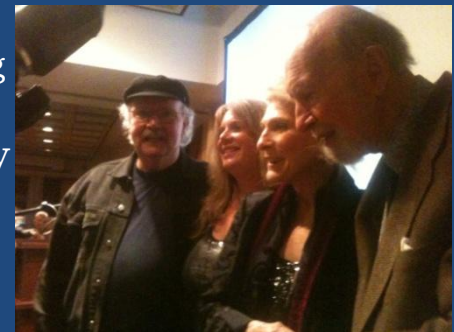
Judy Collins with Tom Paxton, and Pete Seeger