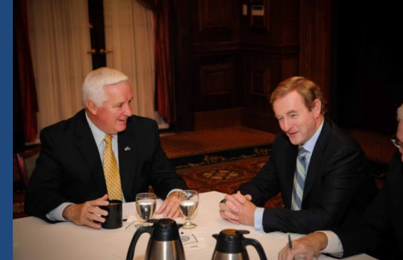
An Taoiseach with Pennsylvania Governor Tom Corbett