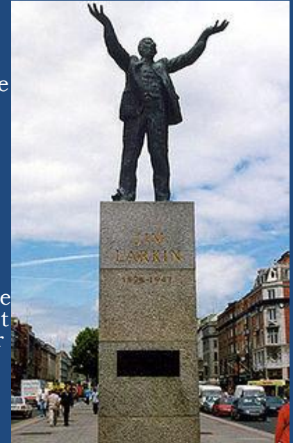
Statue of James 'Big Jim' Larkin, Dublin